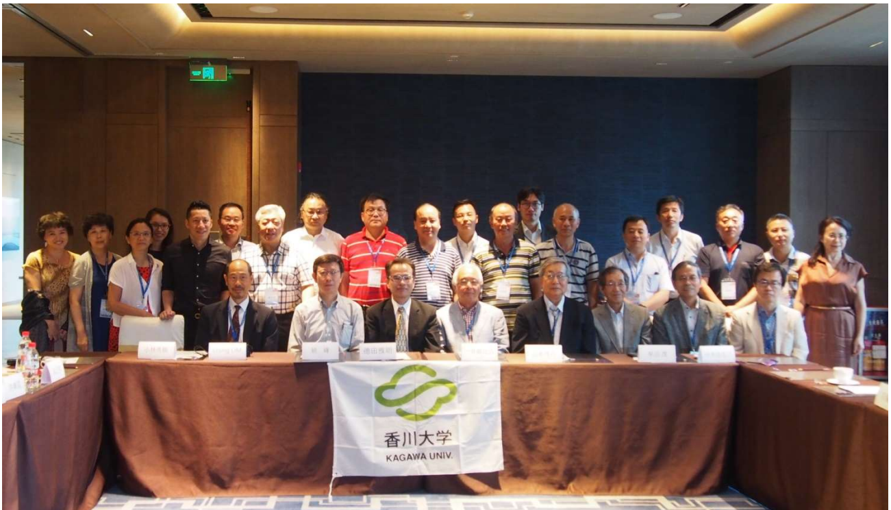
The 5th General Meeting of the Faculty of Agriculture, Kagawa University Chinese Alumni Network of International Students held in Tianjin City