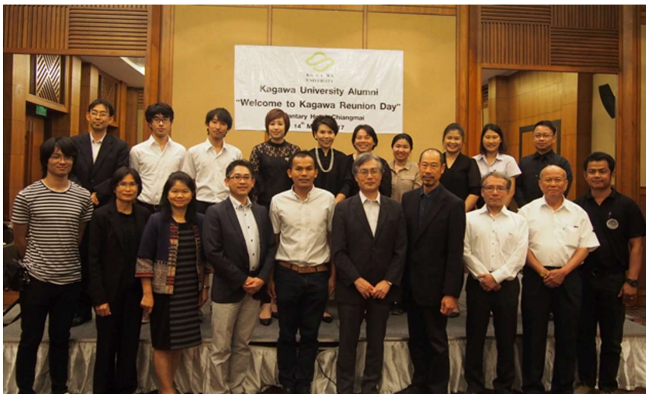
The 3rd General Meeting of the Faculty of Agriculture, Kagawa University Thai Alumni Network of International Students held in Chiang Mai City